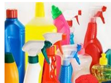
Plastic Polymer Industry