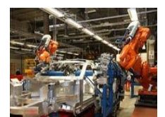
Auto & Ancillary