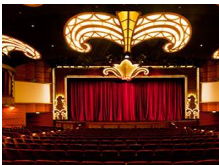
Cinema & Entertainment