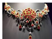
Gems & Jewellery