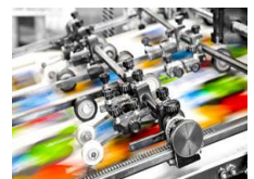
Printing & Packaging