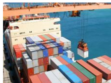
Trading & Distribution