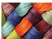
Textile & Apparel